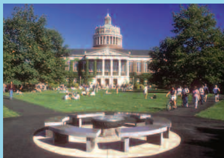
The Rush Rhees Library, the most well-known building on campus, is named after university president and district heating proponent Rush Rhees, who served in the early 1900s. The building is connected to the district heating and cooling systems and will soon be connected to the new hot water system.

Shortly thereafter, the university received a proposal to install a 13 MW gas turbine at the plant, and although it offered minimal financial benefit, this proposal triggered an internal evaluation of the university's cogeneration potential that led to the project that was eventually approved and implemented.