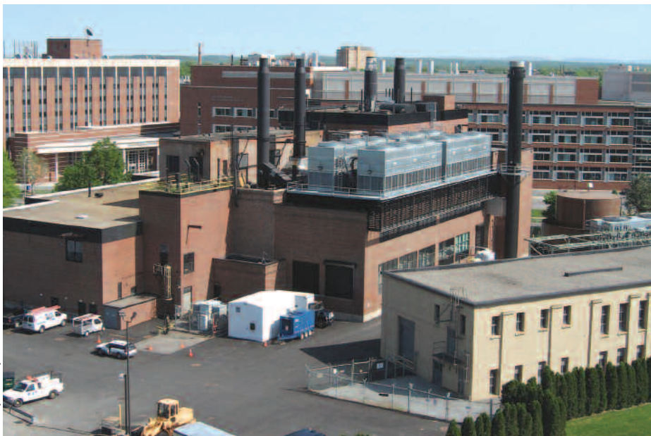
The University of Rochester's new cogeneration facility can produce up to 250 MMBtu/hr of hot water for the hot water district heating system and 25 MW of electricity. Although cogeneration had been a topic of discussion at the University of Rochester since institution's early days, the technology was finally implemented with the startup of this new plant in 2005.

20-year-old preinsulated pipe still in good condition with new pipe that has much lower thermal losses with a good economic payback.