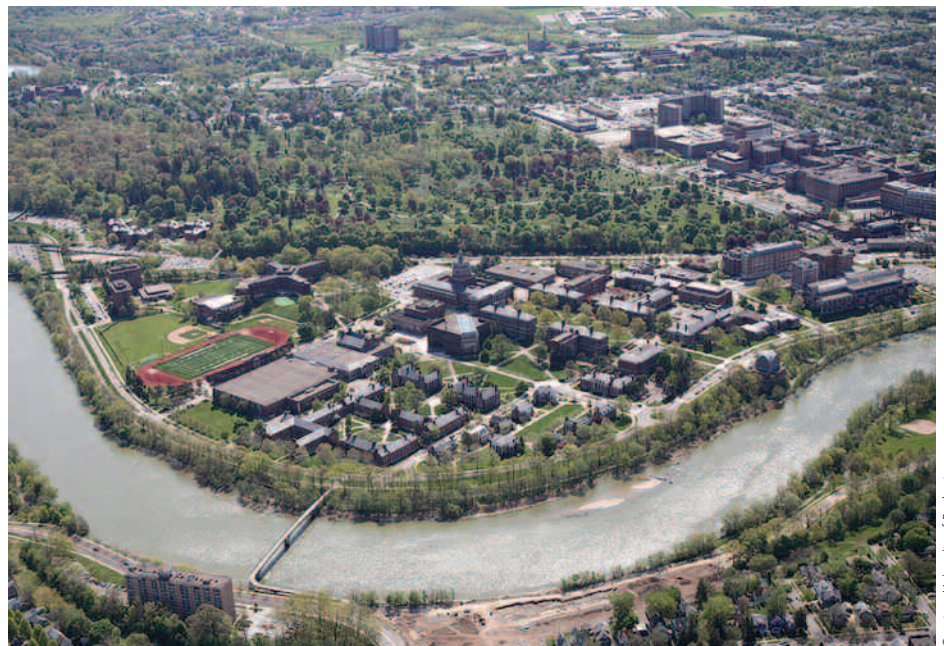
The Genesee River winds along the University of Rochester's main campus, which, together with the adjacent Medical Center Campus (at right), is served by the new low-temperature hot water district heating system.