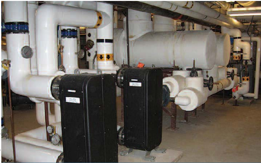
Most of the heat exchangers installed during the university's hot water system construction are brazed-plate-type units (foreground), shown here along with the older steam models, which were abandoned in place.

Mlb of steam were used by remaining steam loads served by the central plant. The hot water system now accounts for about 42 percent of the central